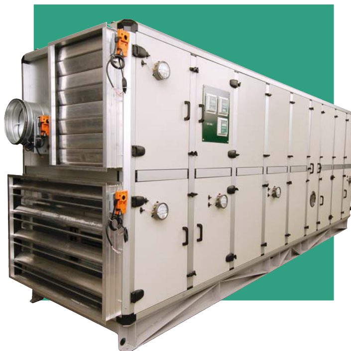
Flexisorb dehumidifier, model RF-101G, W 1,3 m, L 5,8 m H 2 m,

The Flexisorb system allows every dehumidifier to be adapted to suit your own specific requirements.